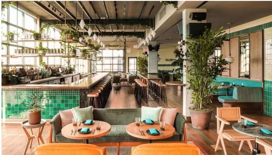
Chicago's Cabra Cevicheria is a Peruvian-inspired restaurant at the top of the Hoxton Hotel. And it... [+]